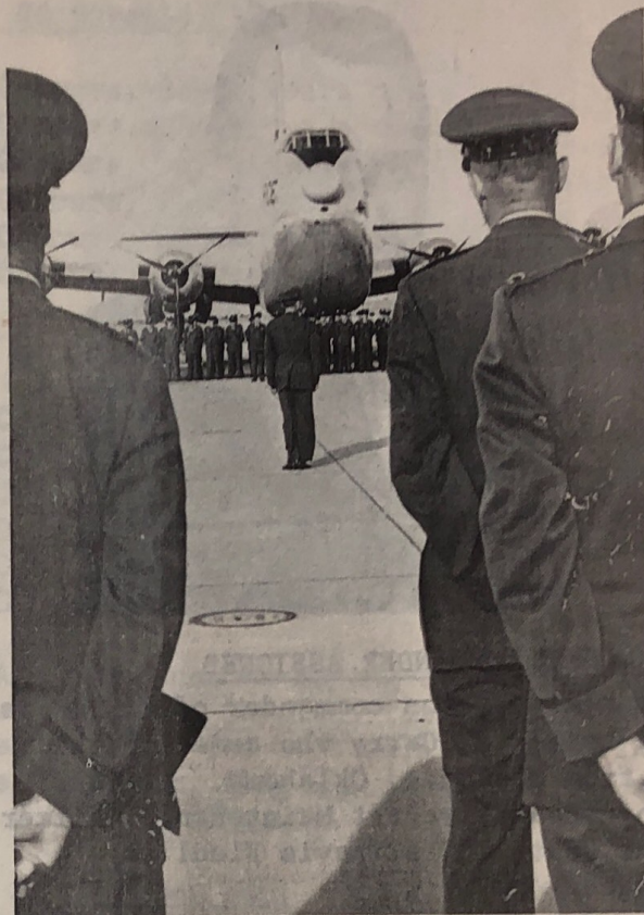
THE GROUP STAFF WAITING FOR THE ADJUTANT TO PREPARE THE SOONER GROUP FOR INSPECTION

Presently, 114 officers and 678 airmen are assigned to the 937th for a total of 792. Authorized manning strength was moved recently up to near the 1,000 mark.